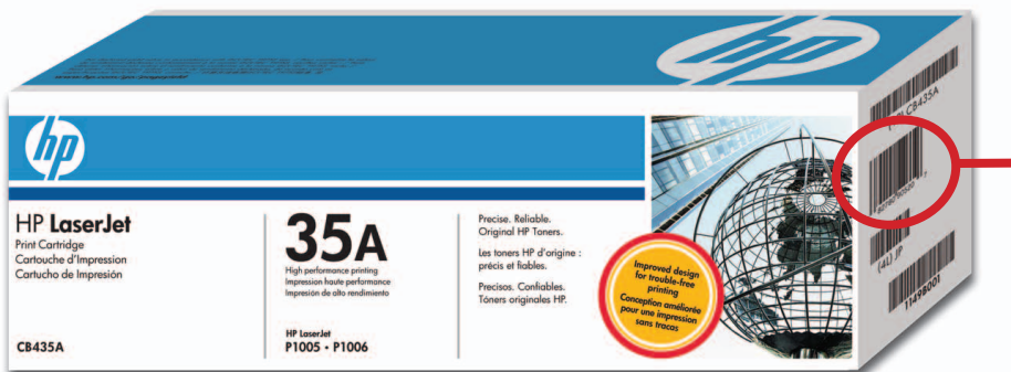
Side of box

The UPC bar code is printed on the outside of your Original HP LaserJet print cartridge product box, either on the side or the back, as shown in the images below.